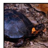
Bog turtle Clemmys mublenbergii United States