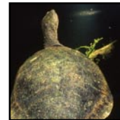
Mary river turtle Elusor macrurus Australia