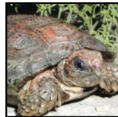
Southern speckled padloper tortoise Homopus signatus cafer South Africa (Succulent Karoo Hotspot)