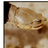
Dahl's toad-headed turtle Batrachemys dabli Colombia Russell A. Mittermeier, Conservation International