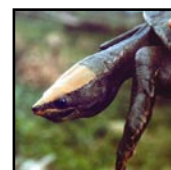
Central American river turtle Dermatemys mawii Central America (Mesoamerica Hotspot)