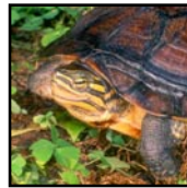
Vietnam leaf turtle Mauremys annamensis Vietnam (Indo-Burma Hotspot)