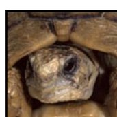
Egyptian tortoise Testudo kleinmanni S.E. Mediterranean (Mediterranean Basin Hotspot)

This list of the world's top 25 most endangered tortoises and freshwater turtles was compiled by the Turtle Conservation Fund (TCF)—a partnership of the Turtle Conservation Fund (TCF)—a partnership of the Center for Applied Biodiversity Science (CABS) at Conservation International (CI), The World Conservation Union Species Survival Commission's (IUCN/SSC) Tortoise and Freshwater Turtle Specialist Group (TFTSG), and IUCN/SSC Turtle Survival Alliance (TSA).