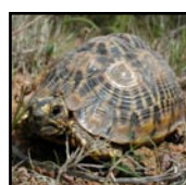
Geometric tortoise Psammobates geometricus South Africa (Cape Floristic Region Hotspot)