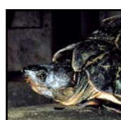
Philippine forest turtle Heosemys leytensis Philippine Islands