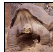
Abingdon Island tortoise (Galapagos Tortoise) Geochelone nigra abingdoni Galapagos Islands (Choco-Darien-Western Ecuador Hotspot)