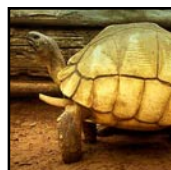
Ploughshare tortoise Geochelone yniphora Madagascar (Madagascar and Indian Ocean Islands Hotspot)