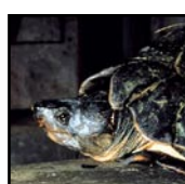
Philippine forest turtle Heosemys leytenensis Philippine Islands